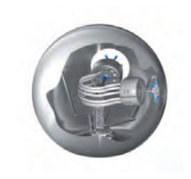
Special HVDC connector